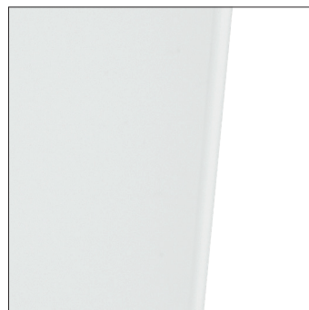
OP opal diffuser