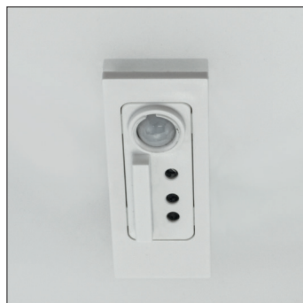
XC daylight&occ sensor

All current index numbers, lumen outputs, power consumption and many other technical information are available in our 2024 pricelist. Details on wireless lighting control systems on page number 896.